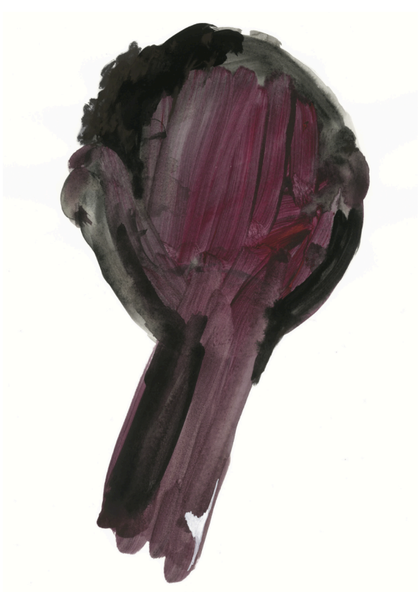
Voçe ta Melhor (2022) Audio recording, approx 3min