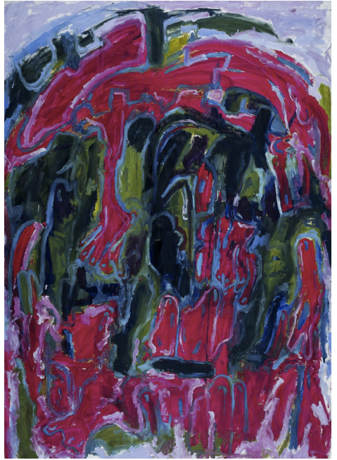
Self-Portrait and Hanging by a Thread (2021)