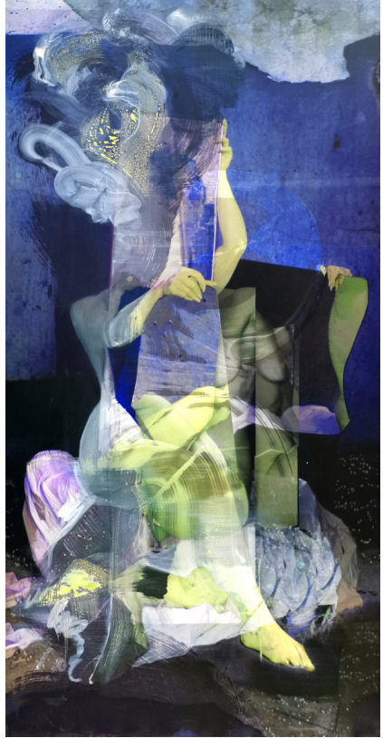
Luminous Dark I and Luminous Dark III (2021)